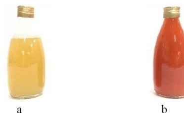
Figure 1. Java-tea-based Functional Drink (a) Without and (b) With Red Fruit Oil Emulsion (Michael, 2019)

emulsion shown in Figure 1 (Michael, 2019).